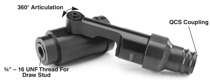
Figure 1 - PH-60C Swiv-L-Punch Head (Interchangeable version)

The Punch Head can rotate and articulate 360 degrees for better access in tight areas.