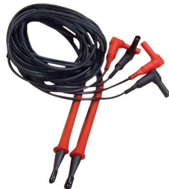
2m CATIV 600V rated compact kelvin probes, 4mm shrouded plugs