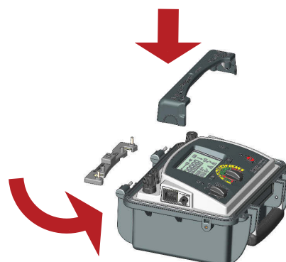
Terminal adaptor Two parts, P terminal bridge and top cover