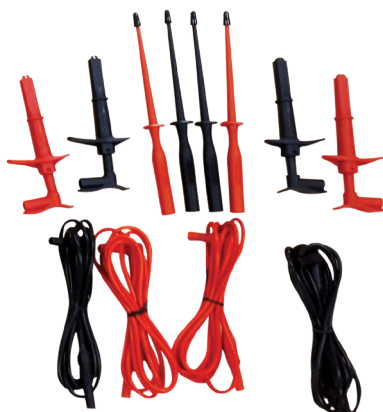
2m current and potential lead set (four wire) with clips and probes