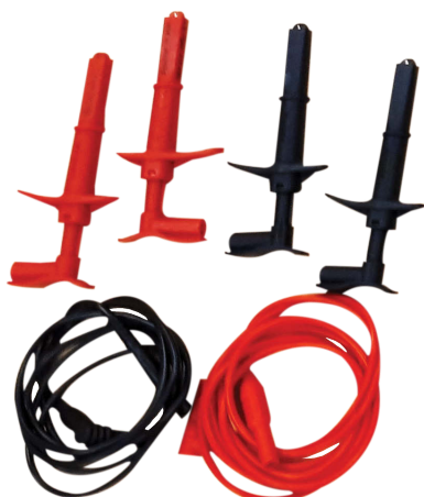
0.5m bridging lead set (used to bridge cable cores to the core being measured)