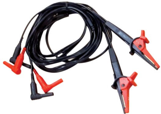
2m CATIV 600V rated compact kelvin clips, 4mm shrouded plugs