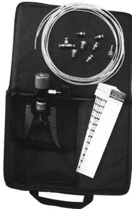
5952P Mid-Range Pump Kit

The model 5837P offers dual ports to allow simultaneous pressure applications to two devices. The compound lever, squeeze action design and light weight allows one-handed operation. The 5952P pump kit includes the tubing and fittings, a package of calibration labels and a carrying case.