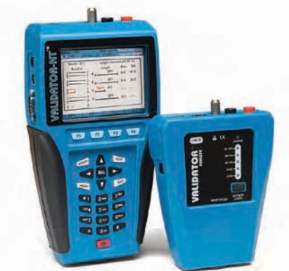
Validator-NT and smart remote