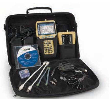
Validator Ethernet Speed Certifier Kit (NT950)