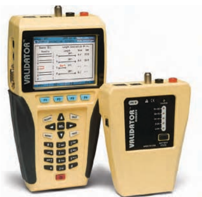
Validator and smart remote