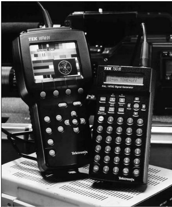
The Tektronix TSG 95 is an ideal companion for the WFM 90 Series Waveform/Vector/Picture/Audio Monitors.