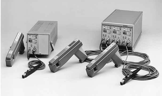
AM503 Current Measurement Family