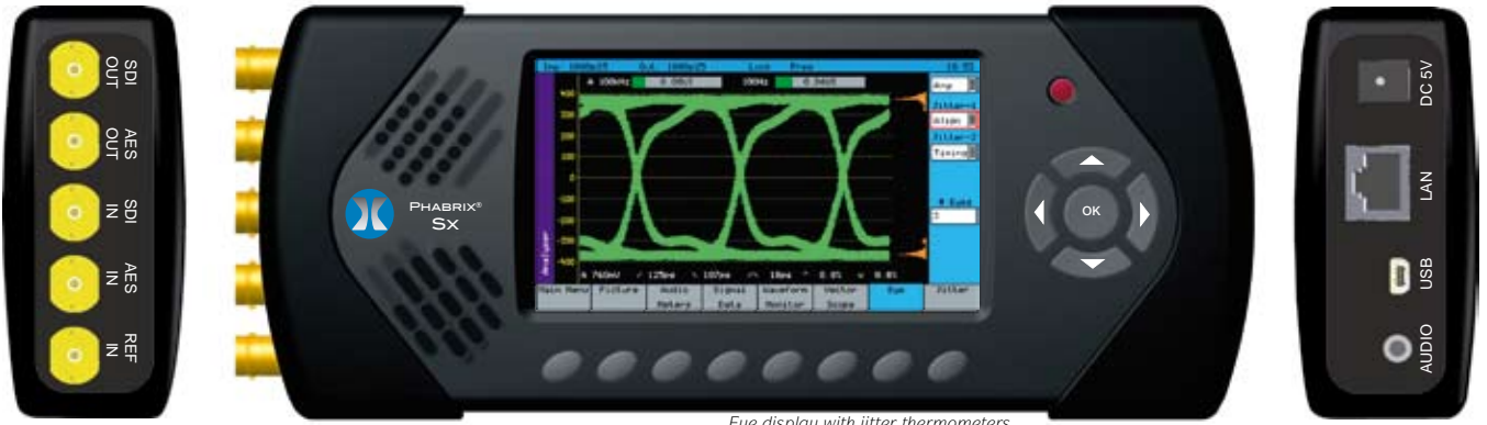
Eye display with jitter thermometers