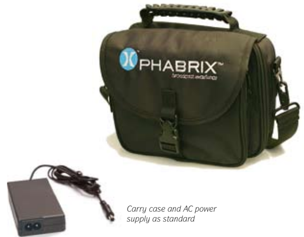
Carry case and AC power supply as standard