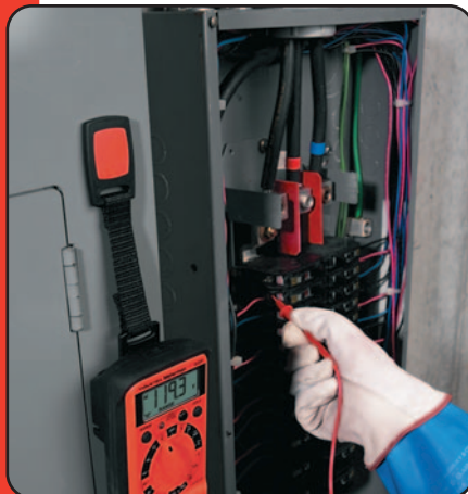
Magna-Grip™ holster frees both hands for work