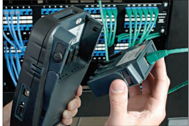
SCT Series adapter employs new "connector-less" adapter technology.

The SCT Series speeds the user through link diagnosis with powerful diagnostic tools found only on the Megger SCT. The instrument pinpoints the distance to link disturbances on each measured pair and displays this data in multiple helpful formats. After completing a certification test the user can choose to generate and display diagnostic results. Diagnostic wiremap displays the length to an open or short on each pair. Diagnostic TD NEXT and TD Return Loss measurements quickly and accurately calculate the distance to and the strength of all disturbances on each measured pair on a percentage scale, where values exceeding 100% are an indication of a link failure. Summary TD NEXT and TD Return Loss display the distance and strength of the single worst disturbance for pinpointing the worst fault. Detailed TD NEXT and TD Return Loss display the distance and strength of each pair's worst case disturbance for quickly pinpointing one or more faults. This is highly useful for confirming connector or cable failures. Graphic TD NEXT and TD Return Loss display every pairs disturbances vs. distance on a graph for pinpointing all possible faults. This is highly useful for diagnosing all possible link failures.