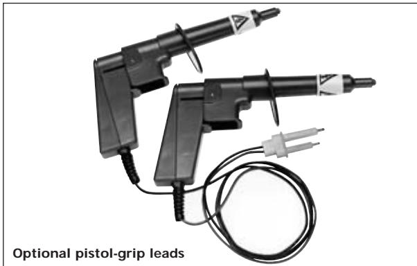
Optional pistol-grip leads