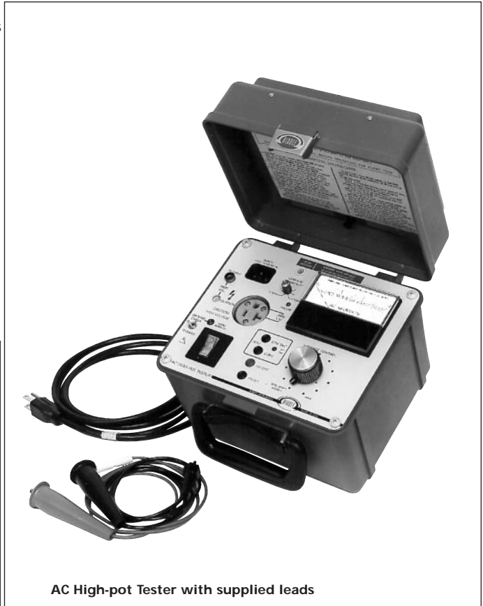
AC High-pot Tester with supplied leads