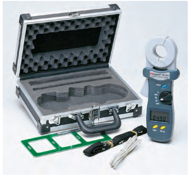
DET10C and 20C comes with a rugged carry case, calibration fixture, carry case shoulder strap and USB interface cable (DET20C only).