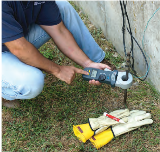
The DET20C instrument is shown being used to test a facility ground.