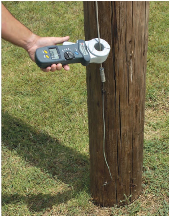
The DET20C instrument is shown being used to test a pole ground.