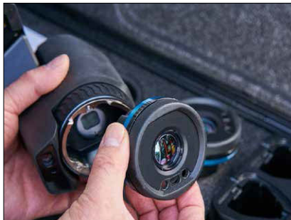
Share lenses (wide angle to telephoto) across your fleet of cameras thanks to AutoCal™ optics