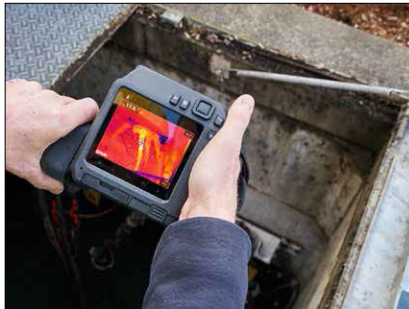
Up to 161,472 pixel resolution for accurate readings on distant targets