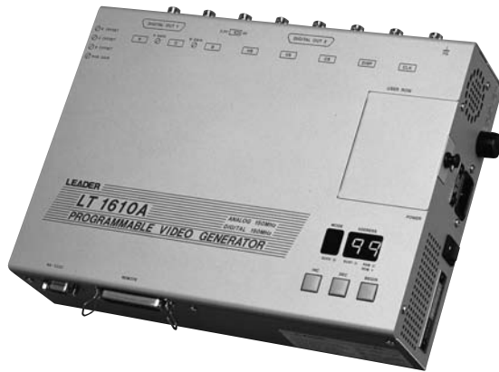
LT 1610A, LT 1611, LT 1612A (LT 1610A shown)

This group of three RGB generators offers dedicated analog, digital or combined analog/digital outputs to best suit application needs. Dot clock frequencies handle a wide range of applications ranging to SXGA (1200 x 1024). All in the group operate from user-replaceable ROMs making them ideal for production operations wherein parameters are not to be altered by operators. Remote control units (LT 1610-01) extend program selection to remote control points and widen operator control to signal output conditions including sync format and polarities. Full PC control gives the operator complete control over raster architecture, signal-output conditions and selection from stock and custom patterns.