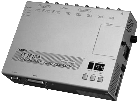
LT 1610A, LT 1611, LT 1612A (LT 1610A shown)

99 Washington Street Melrose, MA 02176 Fax 781-665-0780 TestEquipmentDepot.com