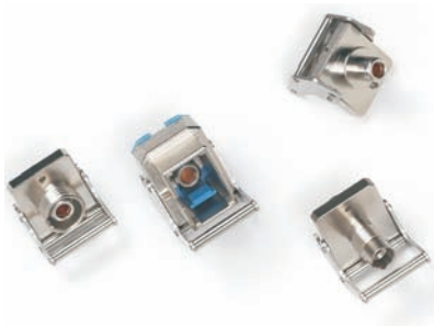
Optical adapters (BN 2150)