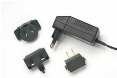
Worldwide compatible AC adapter/charger (SNT-121A)