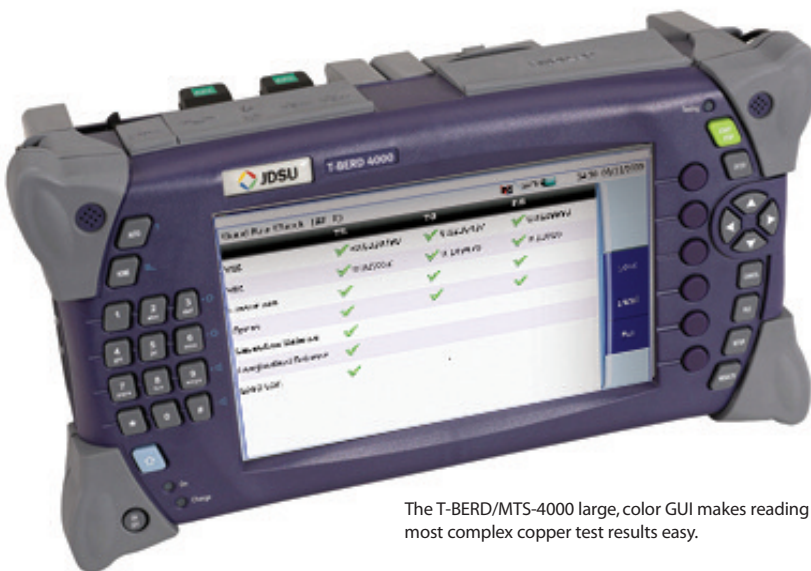
The T-BERD/MTS-4000 large, color GUI makes reading even the most complex copper test results easy.