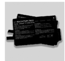
Battery Operation (Optional)