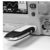
USB Flash Drive