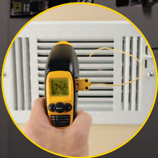
K-type thermocouple probe measures temperatures in hard-to-reach locations