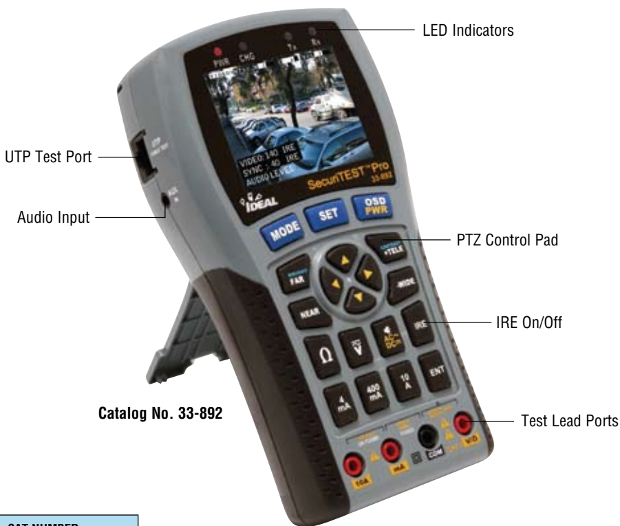
Catalog No. 33-892

SecuriTEST PRO adds to the already impressive capabilities of the SecuriTEST by including all the features of the original, plus IRE testing (video and sync levels), audio level testing, a high-capacity lithium ion battery in a package that's smaller and lighter than before. The SecuriTEST PRO has all the features and functionality that CCTV technicians need to install, test, and maintain analog security camera systems. SecuriTEST PRO also includes a custom carrying case (optional with the standard SecuriTEST).