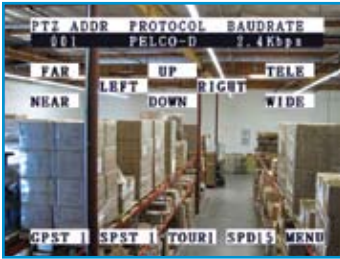
PTZ control with addressing for up to 255 cameras, 20+ protocols and 4 baud rates with selectable RS422/488 communications