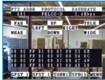
PTZ protocol analyzer can be used in-line to troubleshoot keyboard controllers and cameras