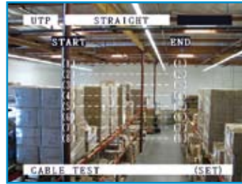
Wire map tester for UTP cabling with clear display of fault condition