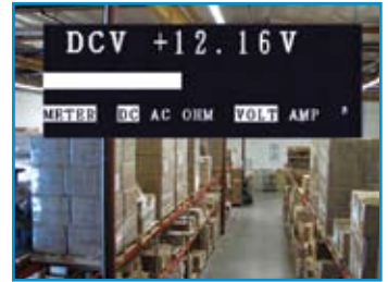
Full function digital multi-meter with large on-screen display tests AC/DC volts, AC/DC current, ohms and continuity. Auto and manual range selections