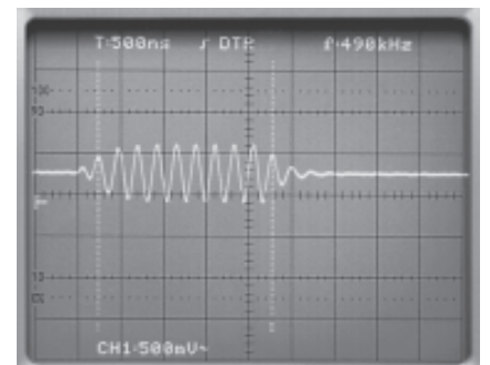
50/100MHz Signals with frequency values

Accessories supplied: Operators Manual and PC-Software on CD-ROM, 2 Probes 1:1/10:1 and Line Cord.