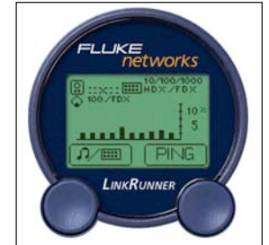
See device capabilities, actual link speed, and utilization levels.