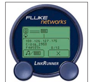
Precisely locate switch ports with Cisco Discovery Protocol.