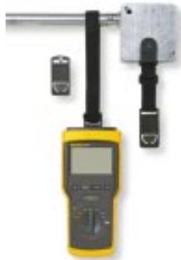
Optional TPAK Meter Strap and Magnet Hanging Kit