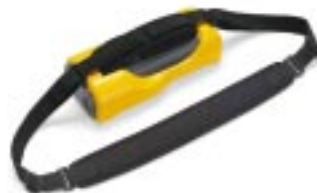
Optional SH 100 Shoulder Strap