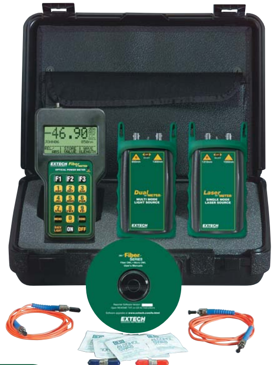
FO600ST2-kit Shown Above