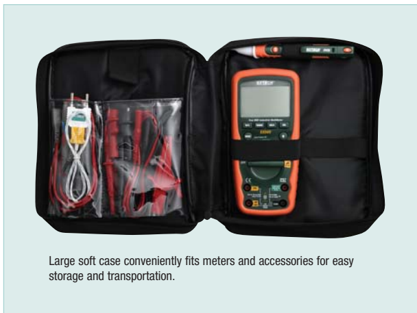
Large soft case conveniently fits meters and accessories for easy storage and transportation.