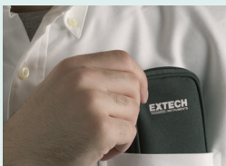
Includes holster and pouch carrying case for added protection