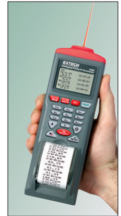
Convenient portable handheld size.