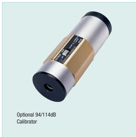
Optional 94/114dB Calibrator