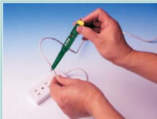
Checking for open wires in cables