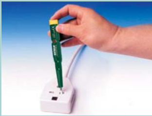
Voltage check in an outlet