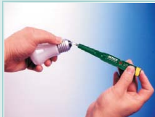
Light Bulb Continuity Check