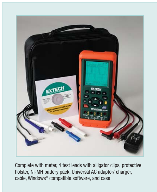
Complete with meter, 4 test leads with alligator clips, protective holster, Ni-MH battery pack, Universal AC adaptor/ charger, cable, Windows ® compatible software, and case