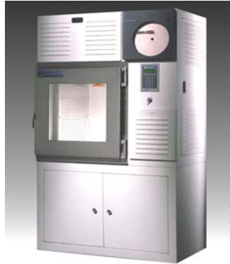
4.5 cubic foot unit (shown with optional base cabinet and recorder)

PGC: (800)438-5494; sales@humiditycontrol.com