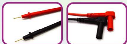
CAT II, 1000V test lead