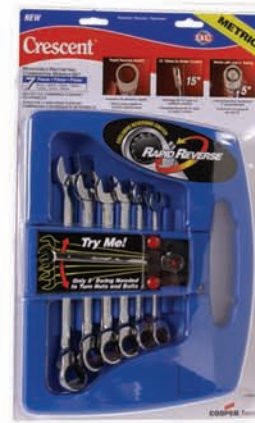
FRRM7 (Metric sizes 8mm, 10mm, 12mm, 13mm, 14mm, 15mm, 18mm)

These wrenches feature a narrow cross-section design for increased versatility, and are made from mirror finished chrome vanadium steel for maximum strength, durability and corrosion resistance. Sets come in an easy-access textured plastic carry case with snap-fit closure.