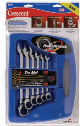
FRR7 (SAE sizes 5/16", 3/8", 7/16", 1/2", 9/16", 5/8", 3/4")