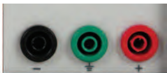
The 9120 series uses 4mm sheathed banana jacks that accept sheathed or shrouded banana plugs and meet the latest international safety standards.