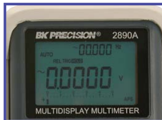
Back Lit LCD