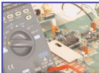
Electronic Circuit Trouble Shooting