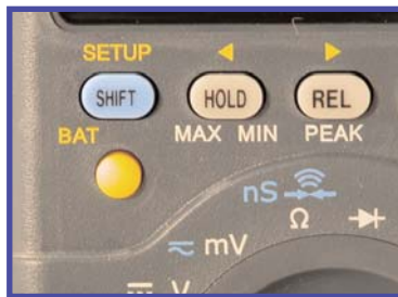
Easy to Understand Interface