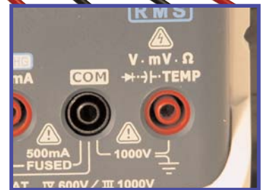
IEC Rated Inputs