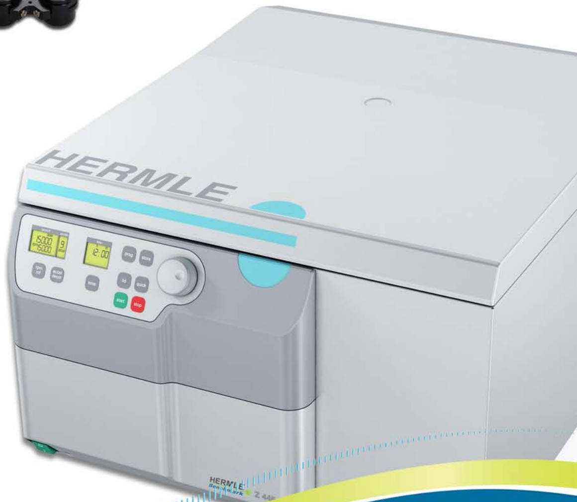
Z446-K Universal Centrifuge