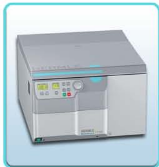
Z446 Universal Centrifuge