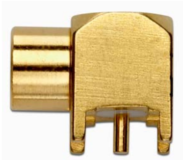
Model 73008 MCX JACK R/A PCB RECEPTACLE