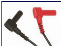
Leads: Double/reinforced 5 ft (1.5m) lead with safety 4mm banana plug