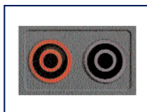
Jacks: Two standard safety banana jacks (4mm)