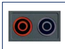
Jacks: Two standard safety banana jacks (4mm)