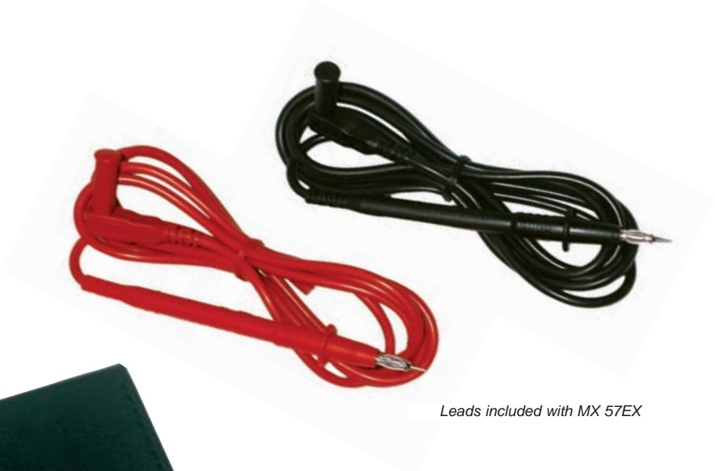
Leads included with MX 57EX