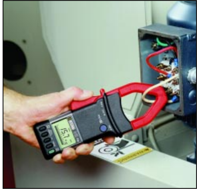
Model F3N measuring phase current on a 3 phase motor.