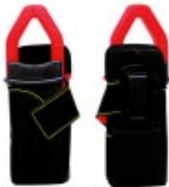
Models F1N & F3N in soft protective carrying holster