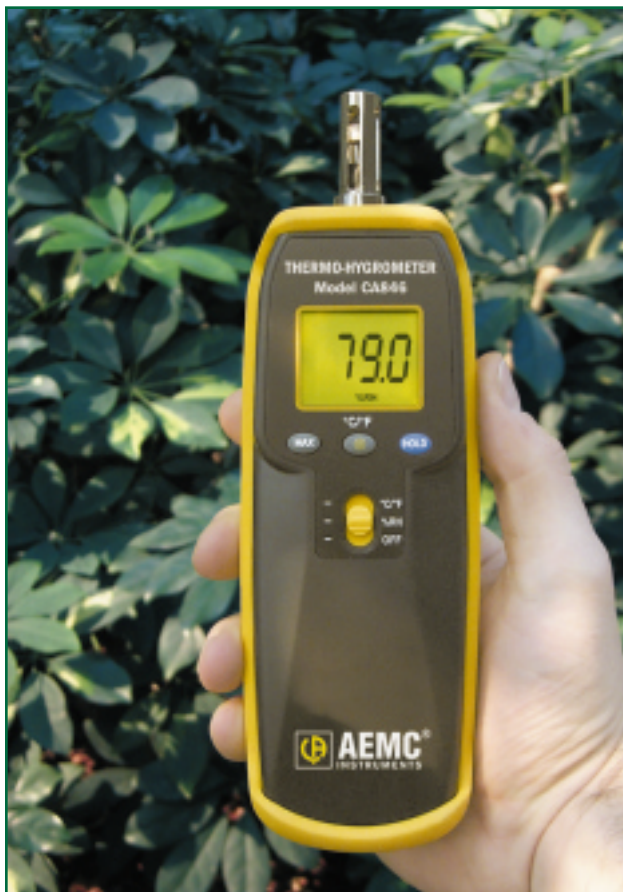
Take accurate temperature and humidity measurements in a variety of environments.