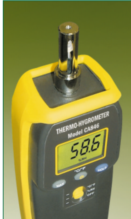
Accurate RTD temperature sensor and quick response RH sensor