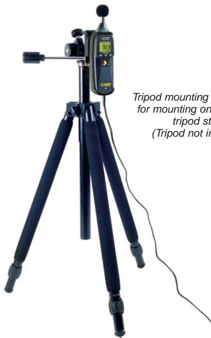
Tripod mounting screw allows for mounting on a standard tripod stand. (Tripod not included.)