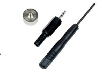
Tripod mounting screw, auxiliary output plug and calibration screwdriver included