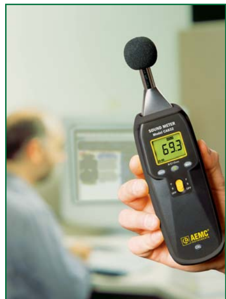
Measure sound levels in office environments.