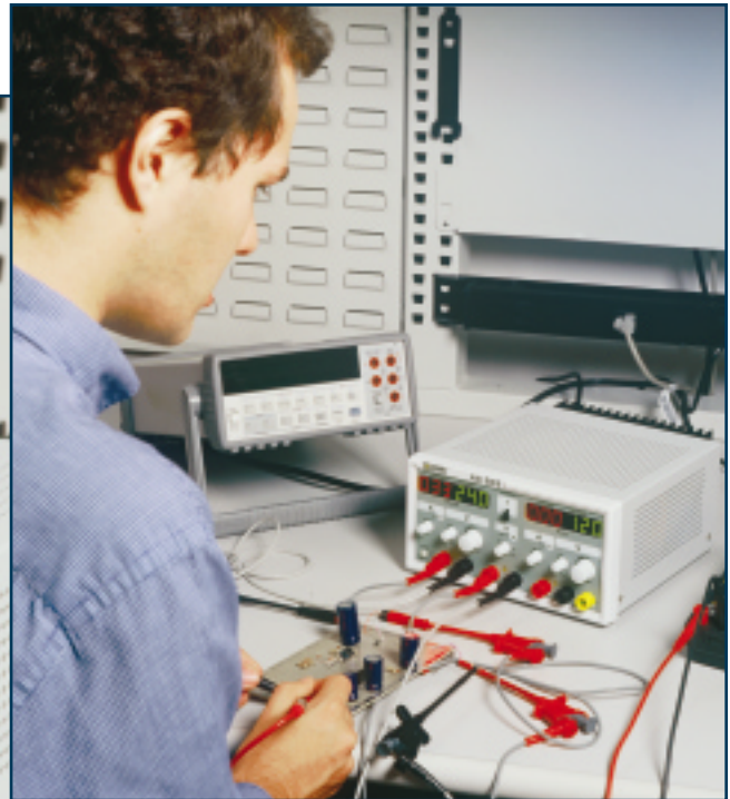
Circuit board design testing using the 30V and 5Vdc outputs