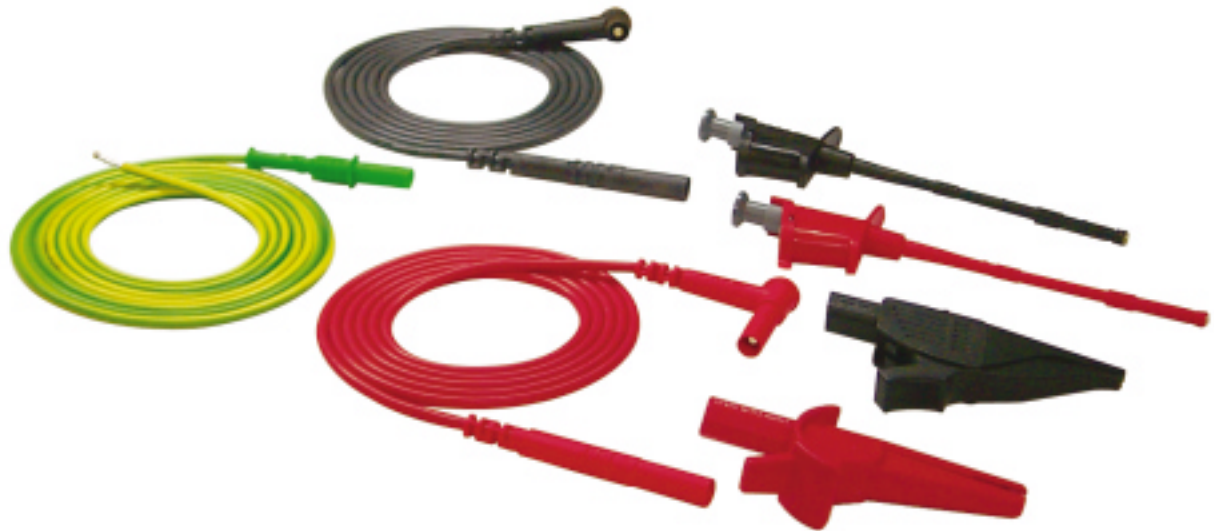
Optional Lead Set includes: two color-coded leads, one ground lead (stripped), two alligator clips, and two grip probes Catalog #2117.78