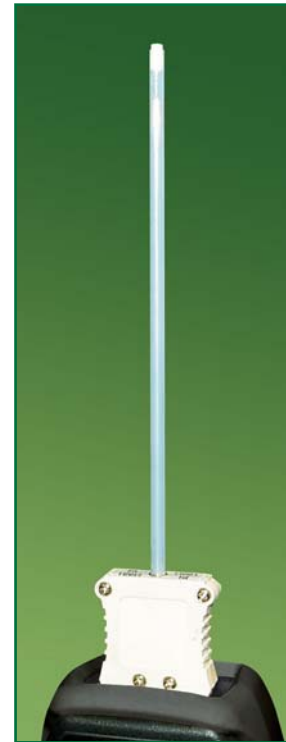
Model CA865 is supplied with RTD sensor for accurate measurements

The RTD Thermometer Model CA865 is a portable, compact digital meter designed to use an RTD Pt385/100Ω as the temperature sensor for precise temperature measurements in a variety of environments. The RTD probe provides for fast response time, accurate measurements, and good repeatability.