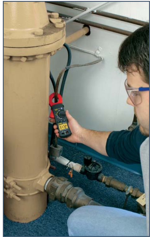
Measuring leakage current on a ground wire with the TRMS Leakage Current Meter Model 565