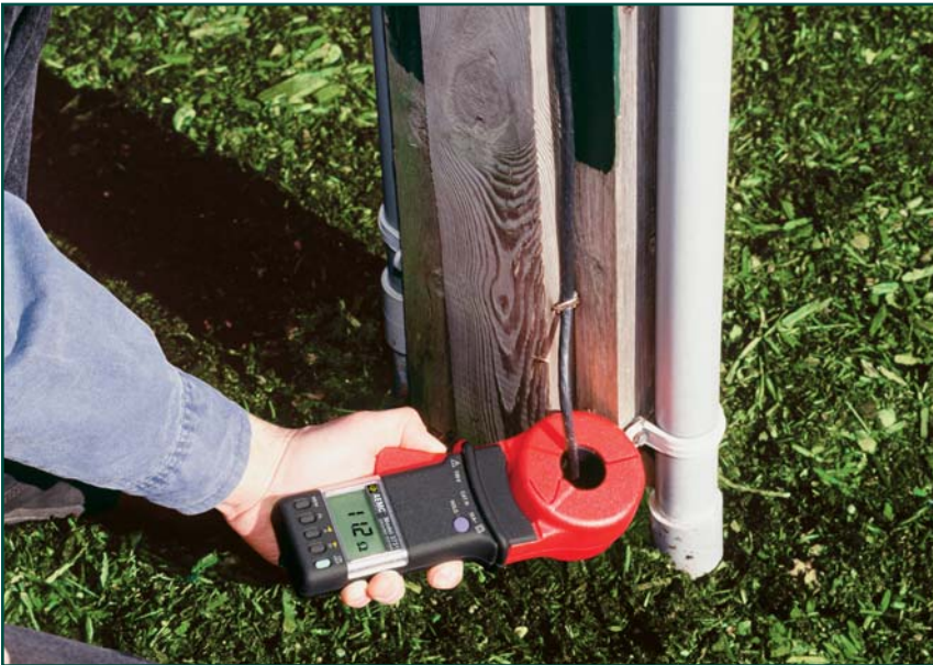
Model 3731 performing a ground rod resistance check.