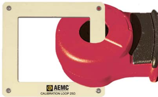
Calibration Check Loop (included)