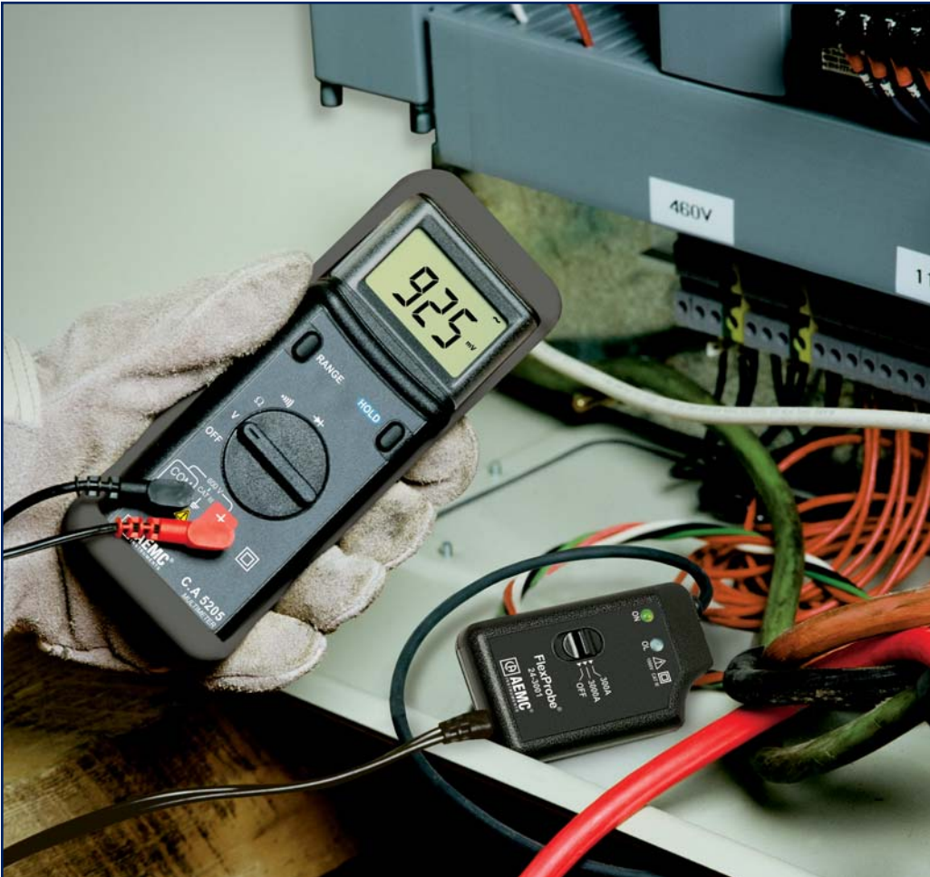
FlexProbe® conveniently plugs into the standard DMM voltage input for direct read-out of the measured current.