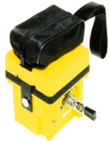
Detachable soft carrying case. The case attaches to the carrying strap.

Test Equipment Depot 99 Washington Street Melrose, MA 02176-6024