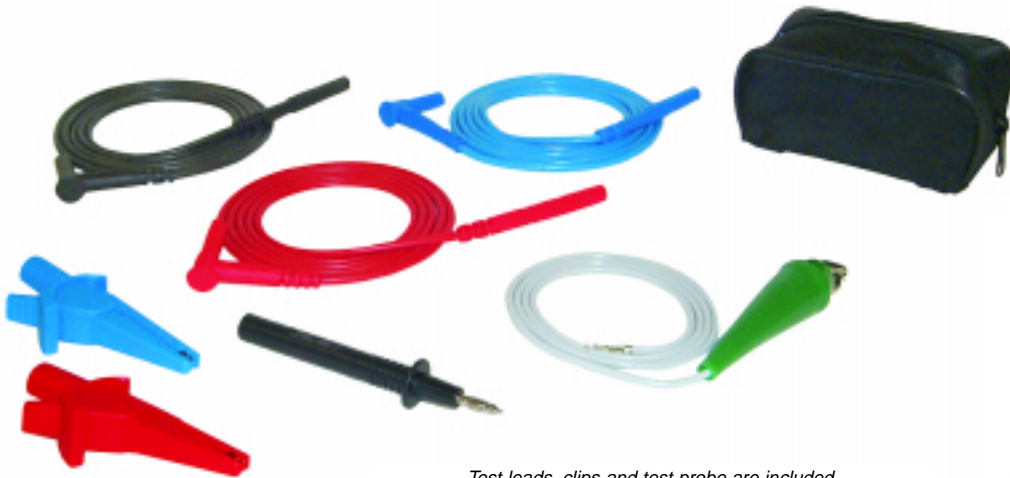
Test leads, clips and test probe are included